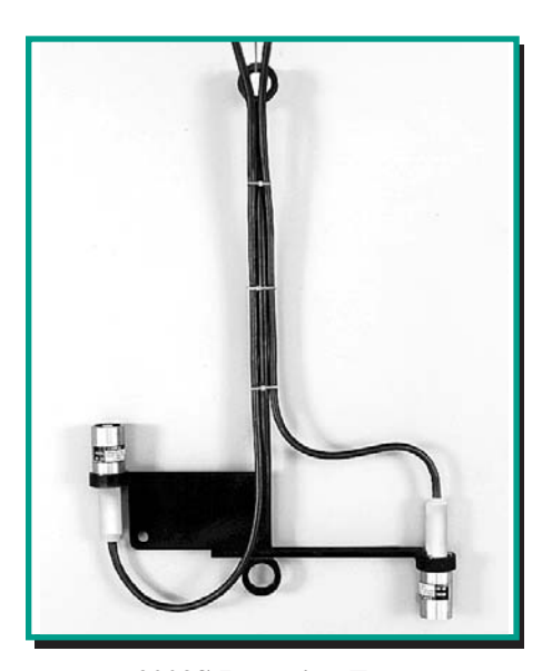
2009S Lowering Frame